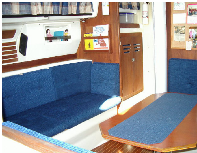
During 2005 Ernie & Marilyn refurbished the interior of "Special Effects". Nineteen cushions were re-upholstered, and 15 curtains replaced. (Picture: Main Cabin)

While at the marina there was also opportunity to inspect "Special Effects" and everyone was duly impressed with her new furnishings.